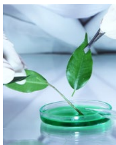
raw materials for cosmetics