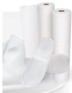
disposable accessories for the beauty industry