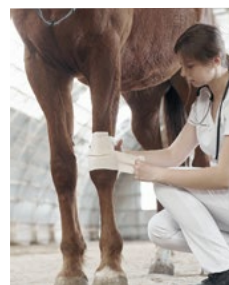
care products for animals