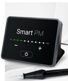
devices for beauty parlours