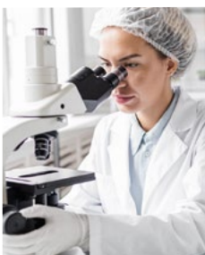
test of cosmetic