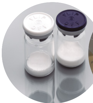
20. Lyophilised vials