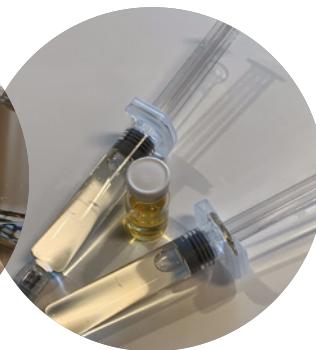
19. Oily solutions in both glass vials and syringes