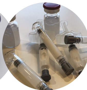
21. Aqueous suspensions in both glass vials and syringes (Glass or polymer)